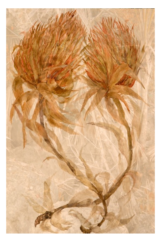
Aechmea caracas, 2008, Watercolor, archival inkjet print on paper, 43" x 28.5"

Aechmea caracas is a painting of a bromeliad native to semitropical habitats observed growing at the edge of a beach. A digital photo of their natural surroundings, balanced between an ideal and a devastating environment, backs the entwined stalks.