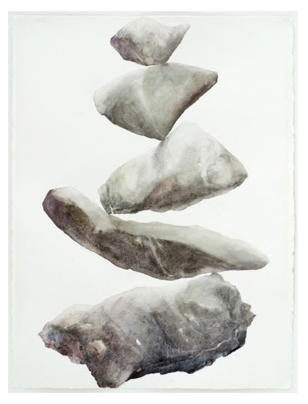
Balance of Substance, 2011, Watercolor on paper, 30" x 22"

This painting and Balance of Substance are part of a series of similarly balance stacks of rocks describe by Sedat Pakay as "a tour of earth's unknown mythology." They balance visually, if impossibly.