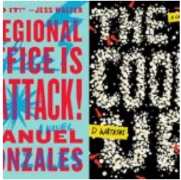
This Spring's Must-Reads