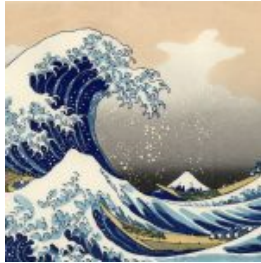
Ruefle, Hokusai, and the American View of Asia