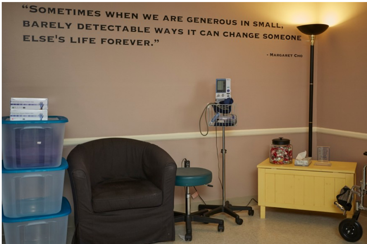
New Voices A Whole Woman's Health Clinic