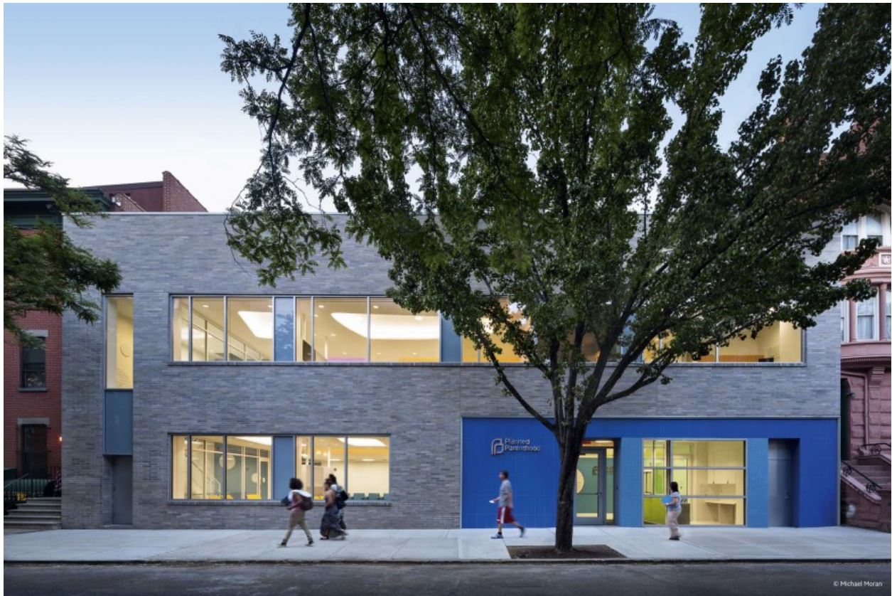
The Planned Parenthood in Queens by Stephen Yablon Architecture

Published in April 2020 in Architect magazine