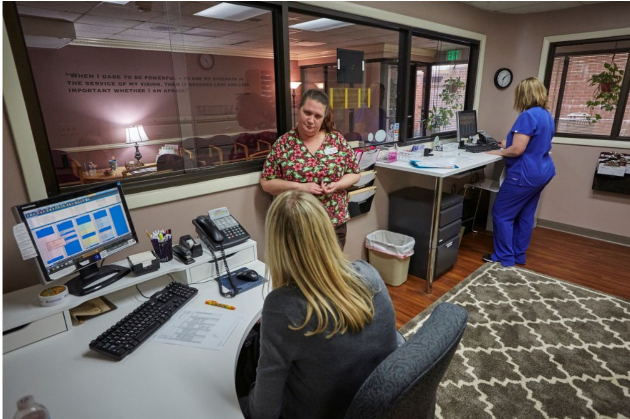
A Whole Women's Health Clinic in Austin

In 2013, Texas passed House Bill 2 (HB2), which placed new, more stringent regulations on abortion clinics. The World Health Organization has classified abortion as a safe procedure for outpatient clinics and physician's offices, which is where 95% of abortions take place in the U.S, according to the National Abortion Federation (NAF), the professional association for abortion providers. But HB2 mandated, among other things, that providers must come into compliance with ambulatory surgery center (ASC) standards. ASCs are a step up from medical offices and provide outpatient surgeries that do not require hospital stays—think knee replacements—requiring facilities to include at least one dedicated operating room. HB2 meant that abortion providers across Texas had to upgrade corridor widths, door and exam room sizes, and HVAC systems, among other things. HB2, proponents argued, would help protect women with a higher standard of care. “This is an important day for