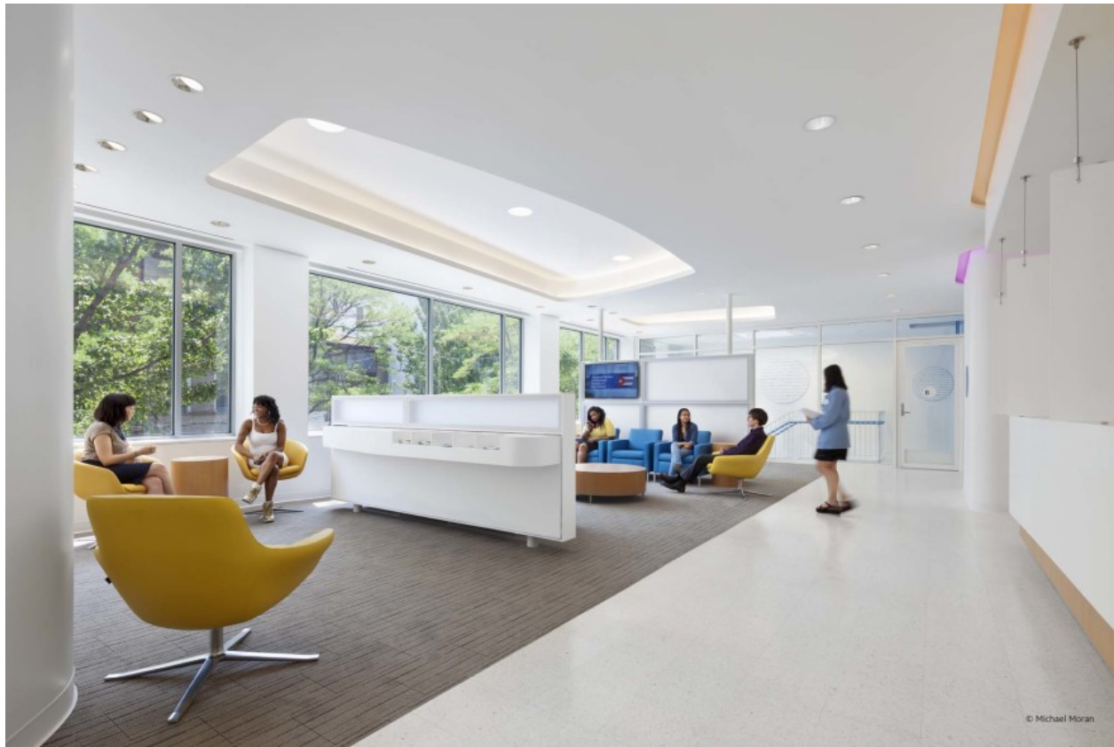
The main waiting room in the Queens Planned Parenthood

refused to allow scaffolding on its land. This meant a costly last-minute change order with the builder who had to figure out how to construct the wall from the inside out by lifting masonry over the interior building slabs. Even getting that masonry proved difficult; one major purveyor of the decorative concrete blocks used in the building refused to sell to an abortion clinic, leading to what Johannes says was a lack of competitive bidding that added unnecessary costs to the bottom line.