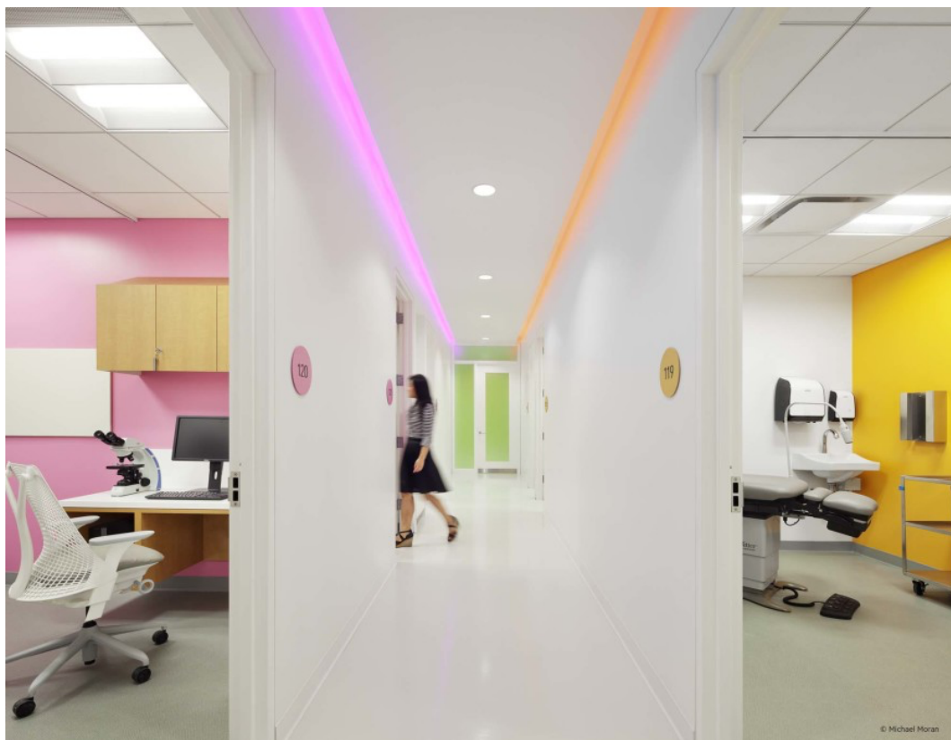
The project's color palette and use of light and wayfinding help it earn an AIA/AAH Healthcare Design Award