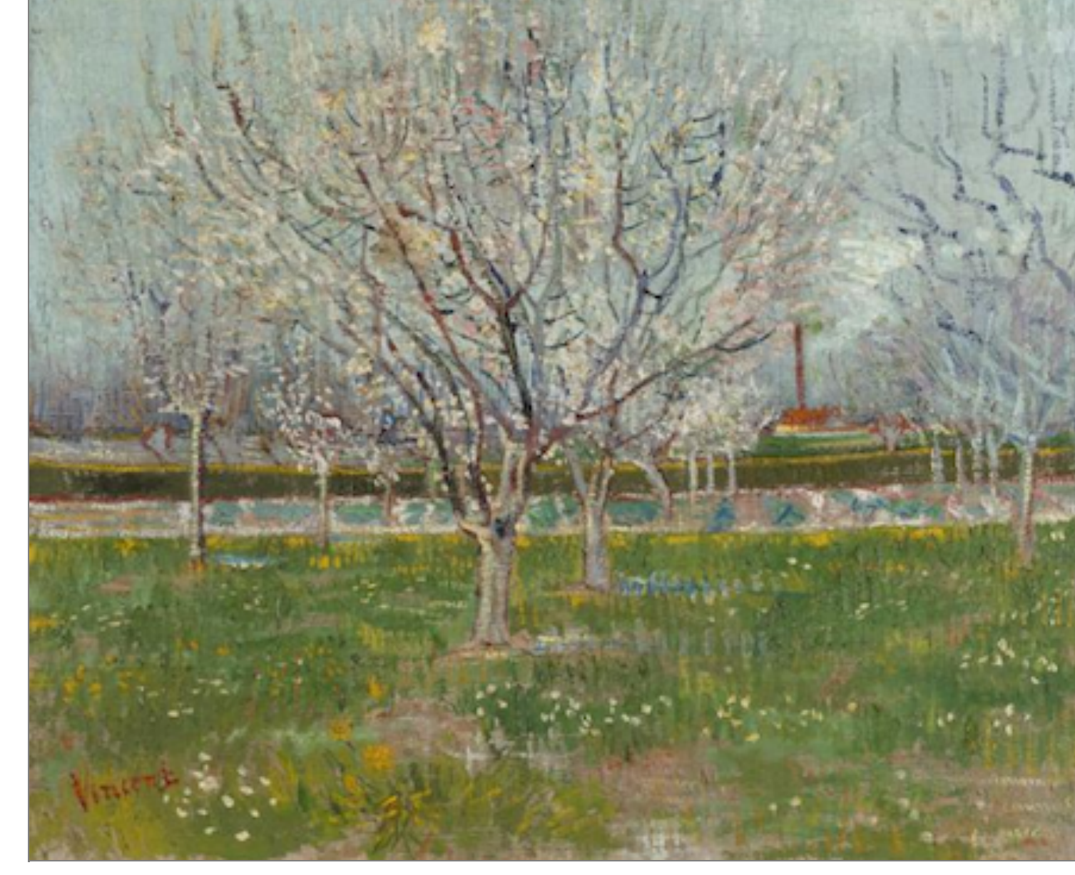
Orchard in Blossom (Apricot Trees), 1888

As if the trees hold snow, spun sugar, cloudlets, bare branches adorned with a light that casts no shadow. The ground shows its own festive confection of blossom and it begins to green, ahead of the trees. In the distance, a red-roofed building with a long thin chimney. A factory. This is a painting of what man hath wrought, the fruit trees planted in neat rows, the red roof making the factory a thing of pride. No, it is a painting of what is far beyond our reach, of the delicacy of spring. A man ploughs behind the orchard, his figure frail as an apricot blossom, nearly an apparition. Man is, after all, an apparition here—here in the making of the thing (the orchard and factory) and here making the painting. Imagine the turpentine cutting the intoxicating odor of the blossoms, the ragged industry smell from that chimney, imagine the April morning chill.