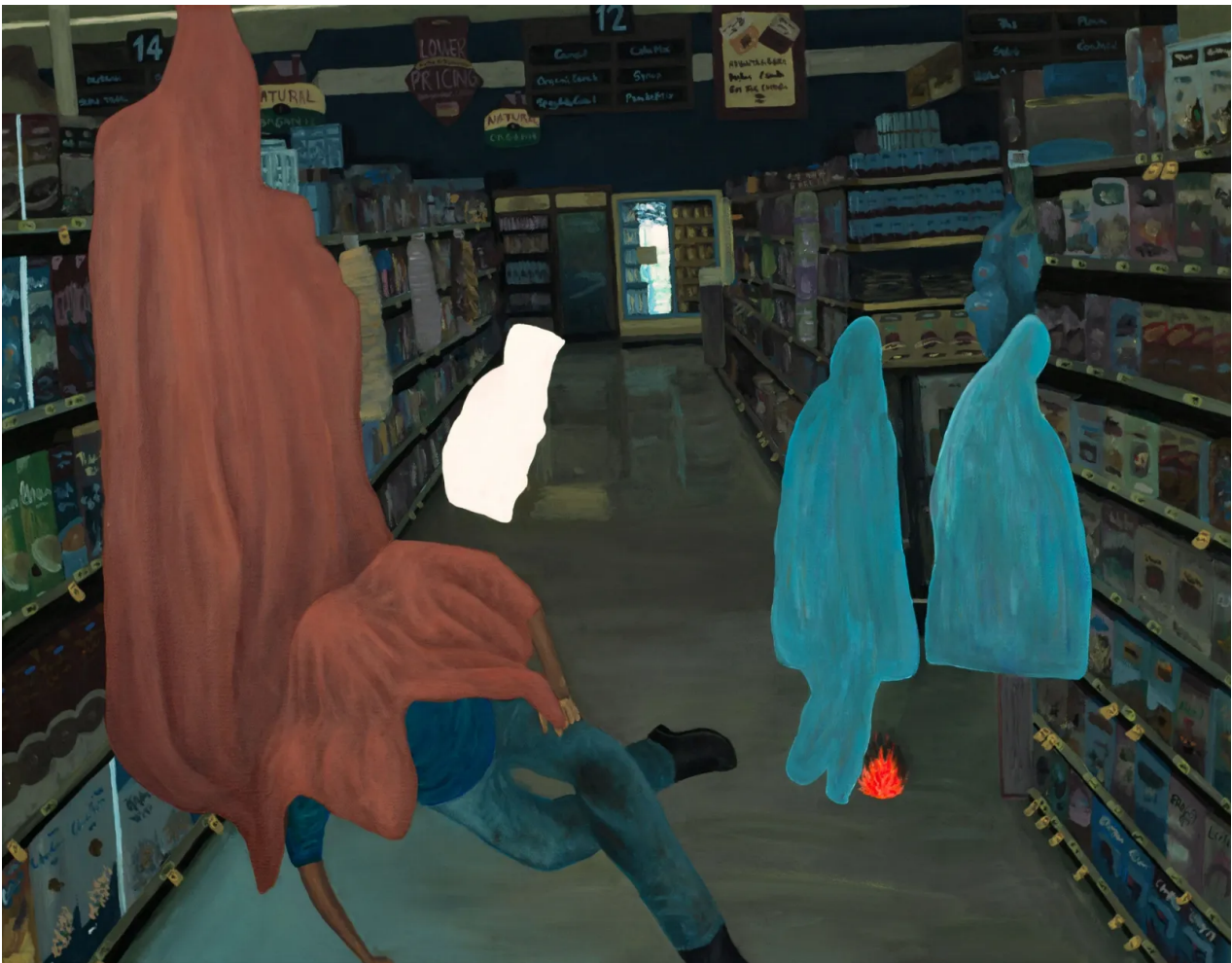
"blanket in a grocery store"