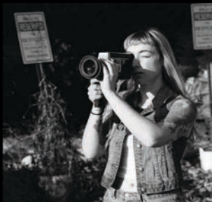
DIRECTOR OF PHOTOGRAPHY