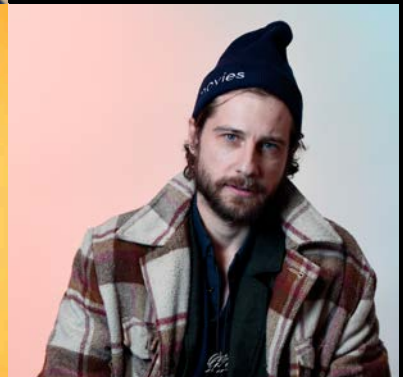
Jeremy Allen White