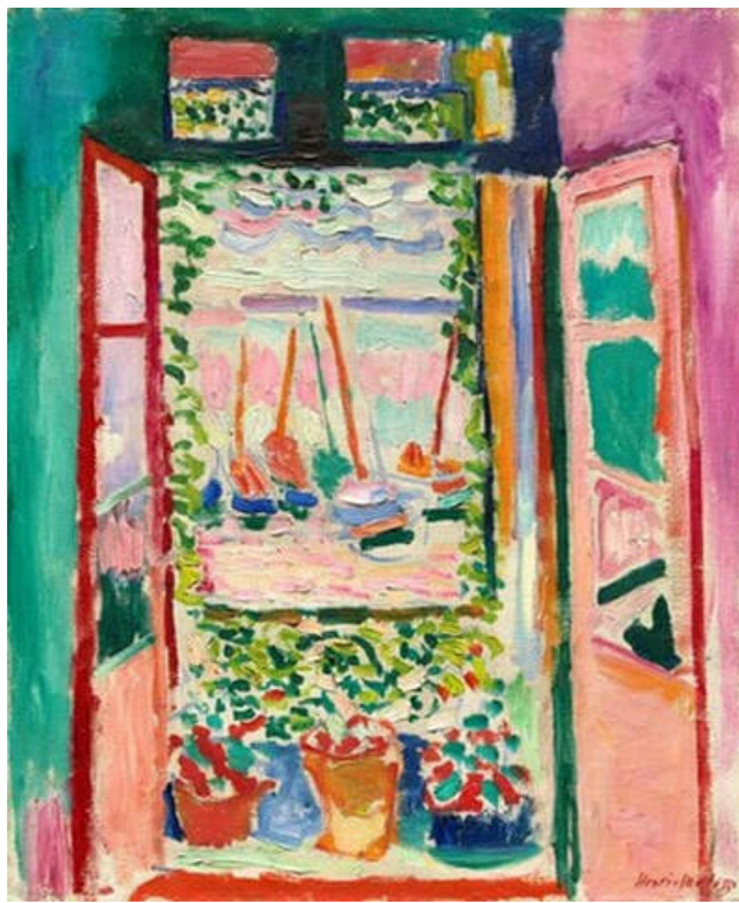
Open Window, Collioure, by Henri Matisse (France) 1905.