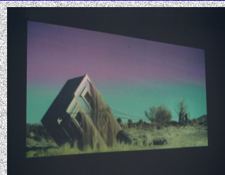
RIGHT + BELOW: documentation photos of Creation Myth installation at In/Flux 2012